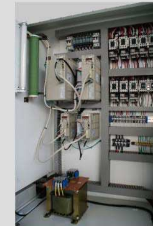
■ The electrical cabinet is a modular design, and is separately mounted from the machine to prevent affection by the machine vibration. 電氣箱模組化。與機台分離安裝，避免機台震動之影響。