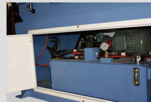
■ The high-performance hydraulic system features smooth running and long service life. 高性能油壓系統，運轉順暢，壽命長。