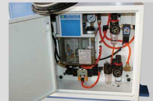
■ Automatic lubrication for mandrel. 通心蕊自動潤滑