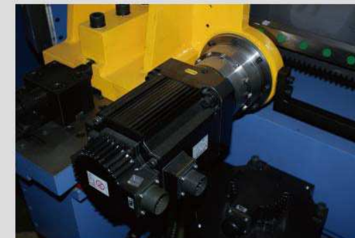
■ Driven by Japan YASKAWA servo motor 採用日本YASKAWA伺服馬達