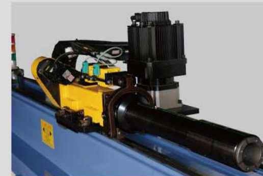
■ The slide ways are mounted with precision linear guide ways. 滑道配置精密線性滑軌