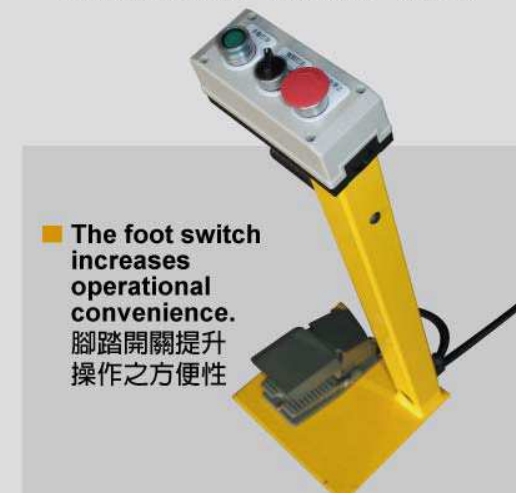
■ The foot switch increases operational convenience. 腳踏開關提升操作之方便性