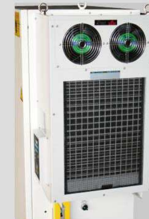
■ The electrical cabinet is equipped with an air conditioner to keep at a constant temperature. 電氣箱附空調冷卻機，以保持恆溫。